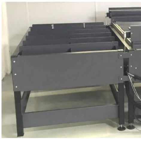
Extension sheet support