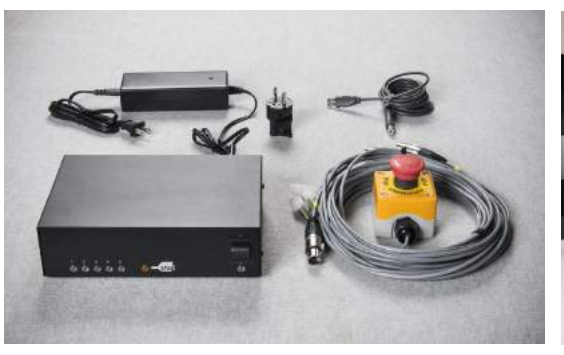
Electronic Control Unit & Cables

The software is configured according to the parameters in the cut charts for the Hypertherm<sup>®</sup> PowerMax<sup>®</sup> 65/85/105/125 generators.